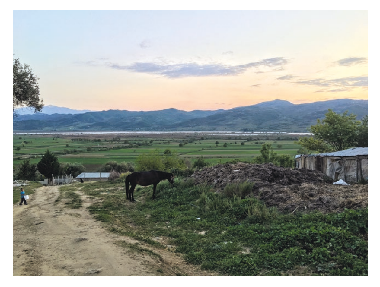
Fig. 6.4 Kutë village and the land which will be flooded by a technical lake should the HPP be built, 2016.

(of similar age), he proudly recounted the history of the village and its surroundings, which he claimed dated back to ancient times. According to Fatjon, due to its position in the river valley, the village prospered in the pre-Ottoman and Ottoman periods when it was important for its agriculture. Fatjon and his friends enumerated the surnames of the village's important patrilines, who still possess important social and cultural capital despite the current economic precariousness. According to Fatjon, Kutë retained an important agricultural role until the fall of the communist regime, when, due to the collapse of the cooperative system, most of the villagers migrated either to larger cities or abroad. Fatjon nostalgically recalled the time when he worked with the pioneer brigades in the fields, building irrigation canals, cutting back the Mediterranean shrubs along the Vjosa, and transforming the riverine landscape into a productive area. His memories, however, soon turned to the current problems and those that will arise when the HPP is built and the technical lake floods their