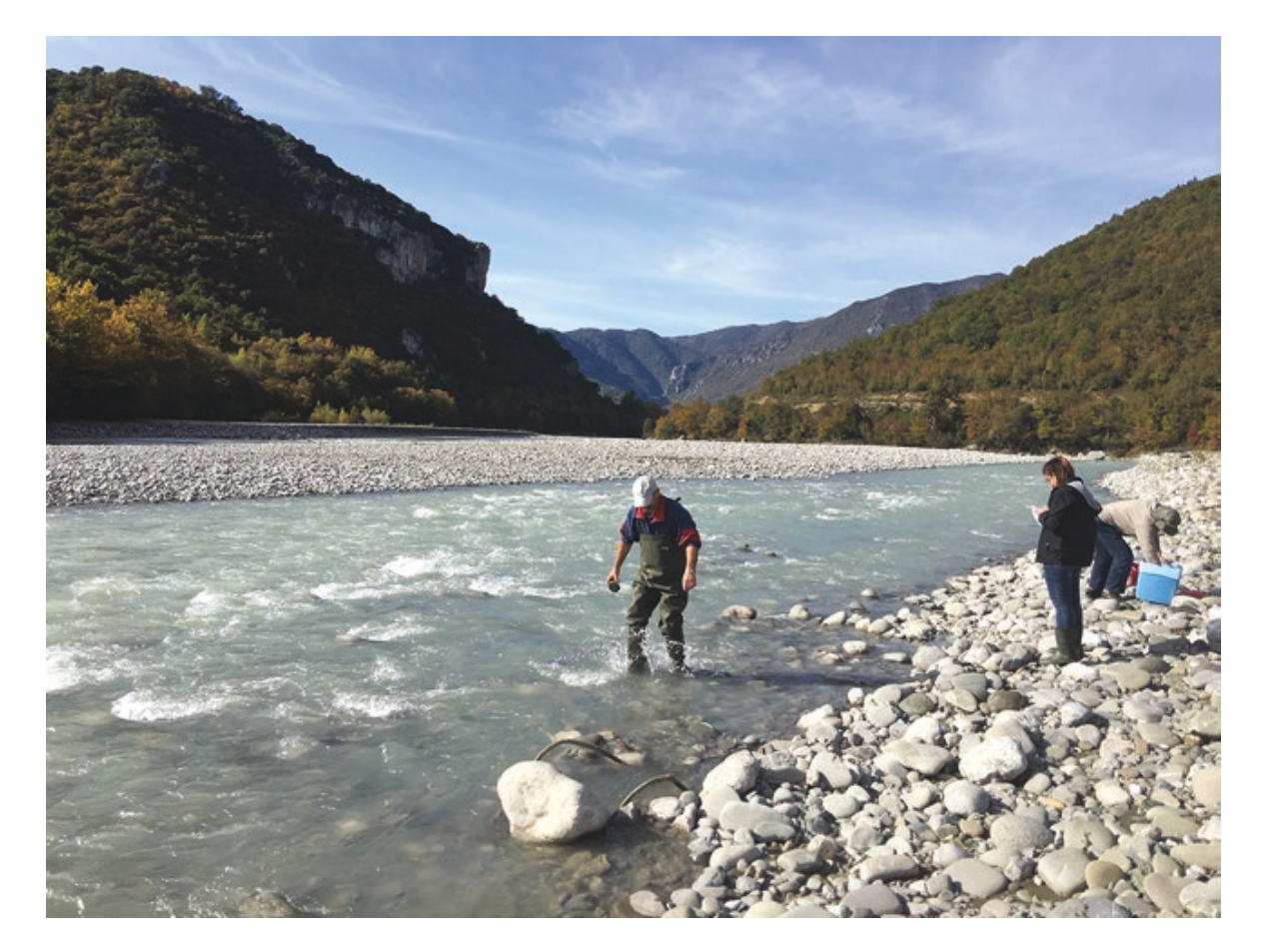
Fig. 6.2 Biologist collecting water samples at the Vjosa River, 2016.

auspices of the Blue Heart of Europe campaign began to inform communities along the Vjosa River about these negative impacts. Against this background, the inhabitants of some villages along the Vjosa, whose fields and properties will be flooded by the technical lake to be created after the construction of the HPP, are organizing various protests and trying to make civil society aware of the gravity of the situation (Fig. 6.3).