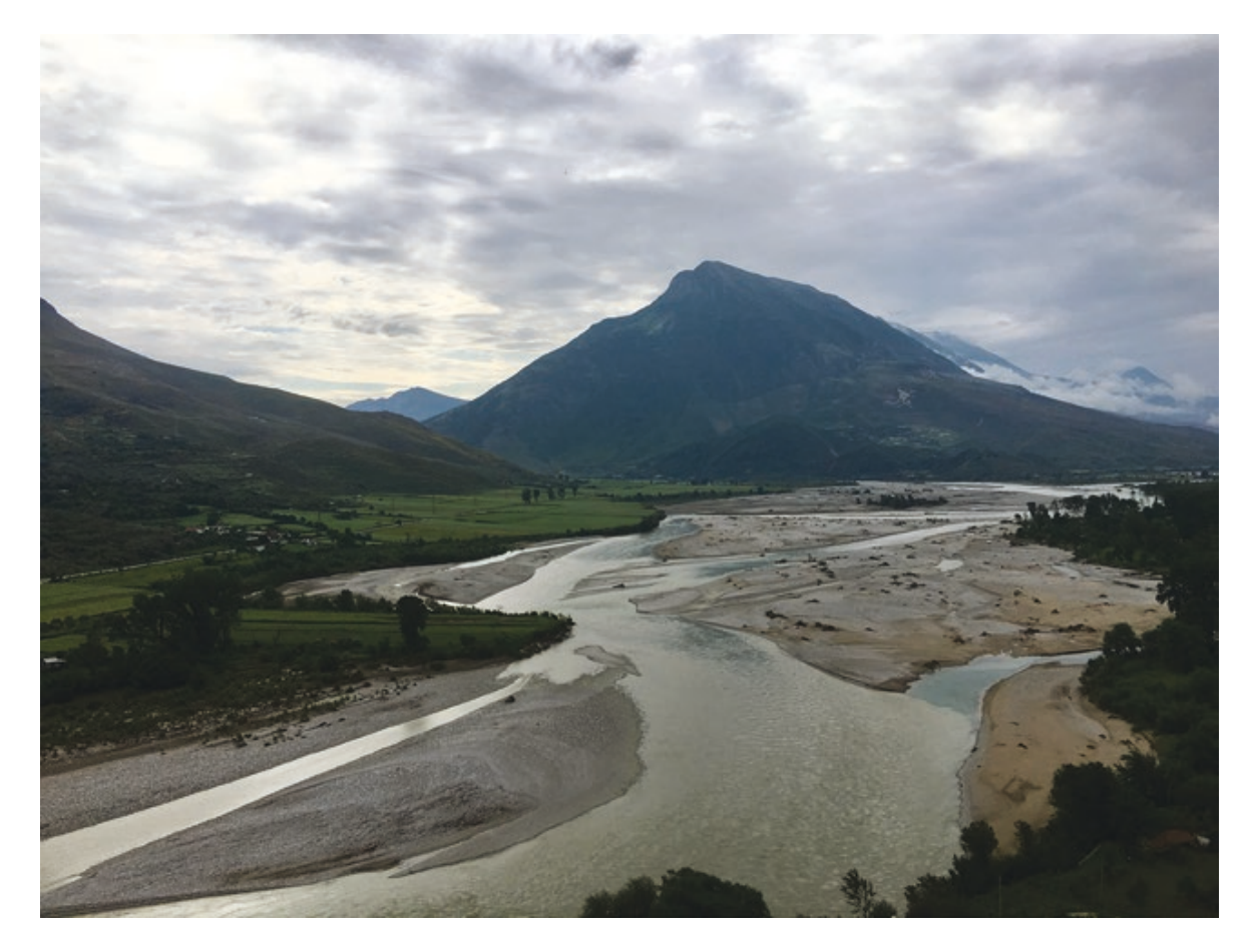
Fig. 6.5 Vjosa and its wide gravel banks, 2016.

There is no life in the village. Many are unemployed. Where can we go? What can we do [ qfarë do të bëjmë ]! The state [ shteti ] does not help us. Right now from here [Kutë] about forty to fifty young people are living abroad. ... Mostly in Great Britain.